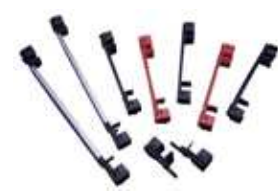
Figure 2: CoolSlot™ card guides are available for a variety of sizes and applications