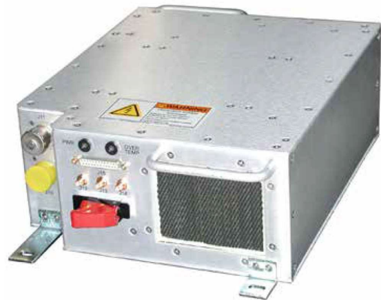
Typical Utilization Equipment Power Supply With Holdup

In the end, it is the responsibility of the system designer to understand the intended functions of the system, and to determine how to design his or her equipment to meet the requirements.